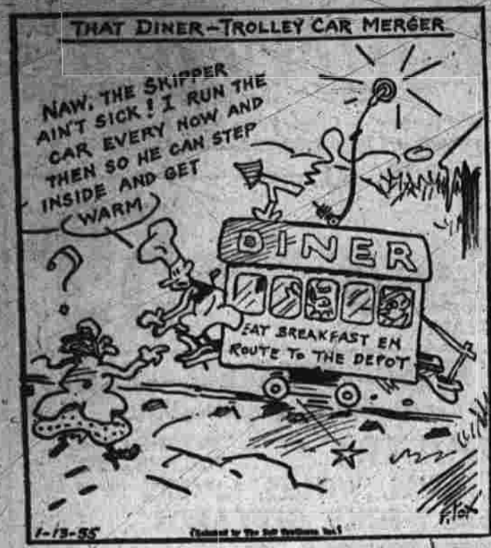
OUT OUR WAY